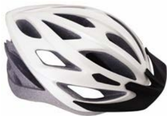
Bike Safety Equipment

Support & Aftersales : IPA facilitates manufacturer warranty coverage and provides replacement bike spares / accessories. Through our years of experience, IPA provides spare parts to meet the needs of aging fleets, as well as recommends new models when Posts are ready to upgrade.