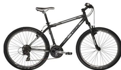
Latest Trek Bike Models