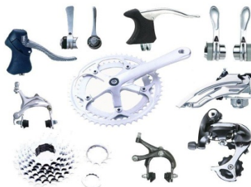
Spare Parts & Accessories