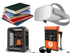
Books, virtual reality, 3D Printing, and Audio Books

Logistical Solutions: RSC received and processed various orders which required separate packaging and shipment for multiple delivery locations within one country. To ensure order accuracy and maximize freight savings, RSC consolidated and shipped the orders simultaneously to alleviate any additional administrative burdens for the receiving country.