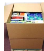
Interior Pallet Prior to Shipment